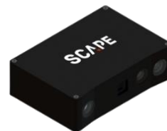
SCAPE Mini Scanner Series