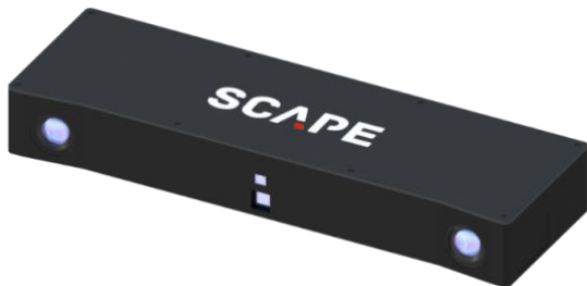
SCAPE Pro Scanner Series